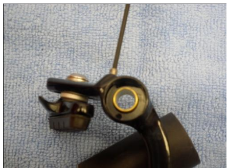
Tension Adjuster Plate - Blocking Adjuster Screw