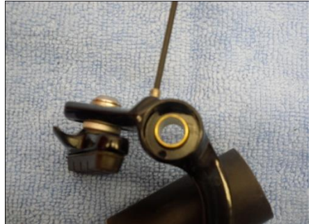
Tension Adjuster Plate - Blocking Adjuster Screw