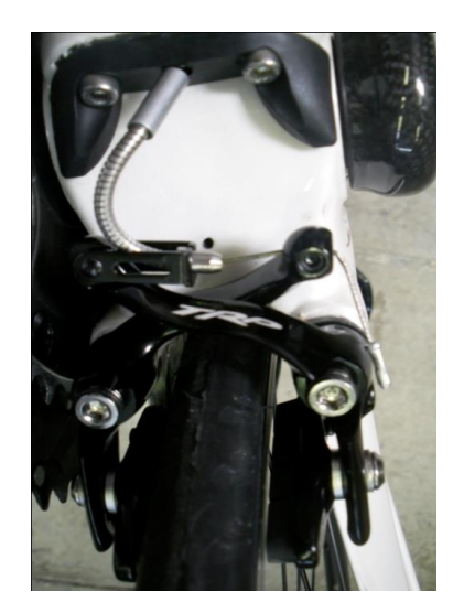
T-822.1 / 922.1