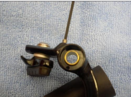
Tension Adjuster Plate – Blocking Adjuster Screw