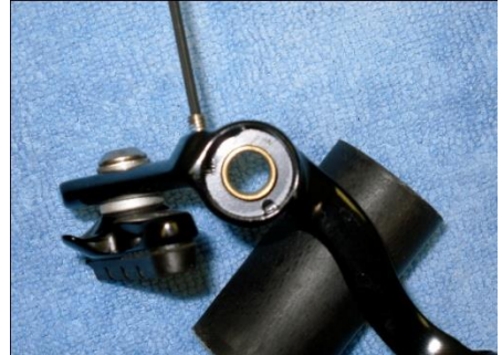
Tension Adjuster Plate - Correct Position